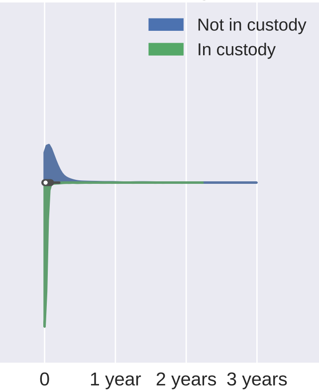
Time To Arraignment